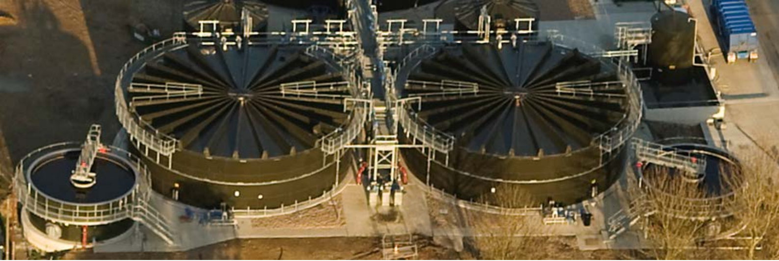
Rotating half bridge scrapers on ACWA treatment plant