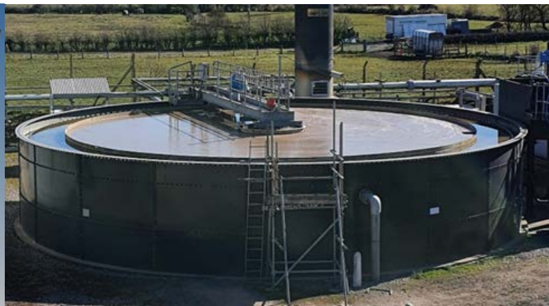
ACWA refurbishment of existing scrapers on an effluent plant