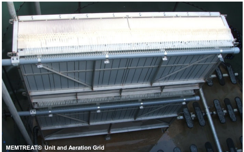
MEMTREAT® Unit and Aeration Grid

The brewery's waste production has also increased and although the wastewater and wash down waters collection network and interconnecting drains have not needed modification, the onsite waste water treatment plant required upgrading to ensure effluent outside the trade effluent discharge consent would not be discharged to the local sewer.